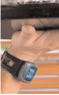
Server's wireless ESP wearable computer "watch."