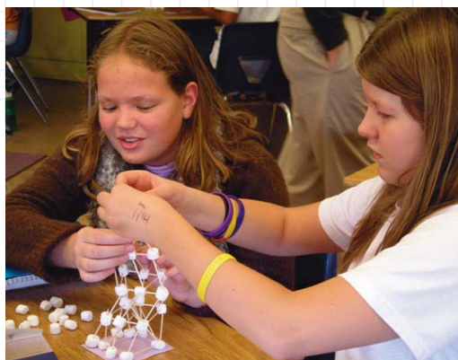
"If we only had some chocolate and graham crackers, we could make s'mores."