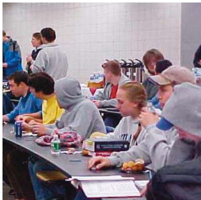
Students enjoyed a break from studying with a movie and refreshments at the December 13 Stress Busters.