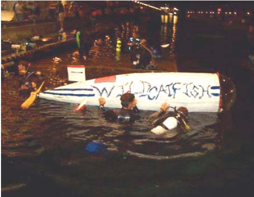
Team Wildcatfish prepares to test buoyancy for their submarine in the David Taylor Model Basin.

The 8th International Submarine Races were hosted at the Naval Surface Warfare Center's Carderock Division David Taylor Model Basin in Bethesda, MD from June 27th through July 1st. Twenty-two human powered submarines from all over the US, Canada and the Netherlands competed in speed trials. This was Villanova's first entry into the competition.