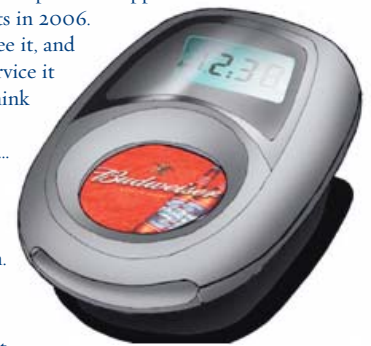
Wireless ESP Table Button, used by diners to communicate with the restaurant staff

More information is available at espsystems.net