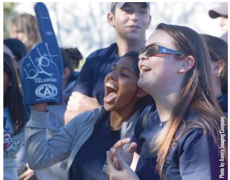
Students enjoyed the fall weather, the picnic fare and the break from studies at the 100th

The initial principal of the fund, representing $125,000, has been used to provide immediate resources to upgrade and modify the existing lab. The balance of the commitment, representing $250,000, will establish an endowment in Mr. White's name to support the equipment and research program needs within the lab.