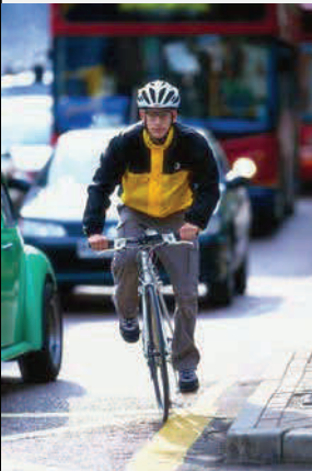
Watch for bike and pedestrian traffic when traveling around campus